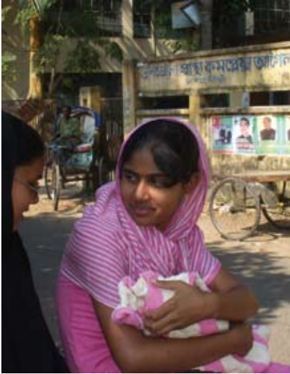
A young mother with her baby arrives with rickshaw van to the upazila hospital.