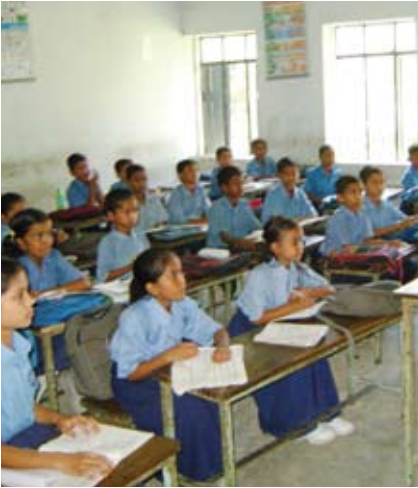
Second Government Primary School - a model for others.