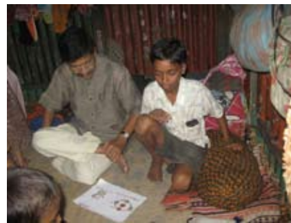
Reality Check in action. A boy having a discussion with one of our team members about school, and describing a drawing he has just made.