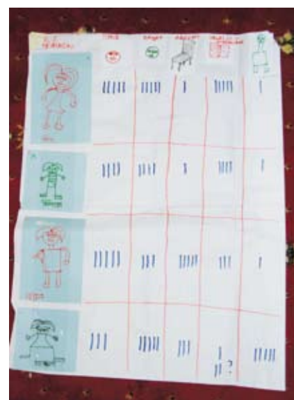
Children score the qualities of their teachers. The qualities listed (left to right): kind, angry, absent, helps us to understand, sleeps.