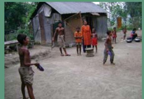
Boys prefer playing to school.

be an 'acceptable excuse' rather than the real case. He may have been singled out a bit more than others (as his friends said) but he wasn't beaten regularly or badly. He grinned at us when we queried this further, 'Actually I like to play more than going to school' . When asked about his future he said he didn't know but, perhaps surprisingly, said he would like to go to school again. (peri-urban Central)