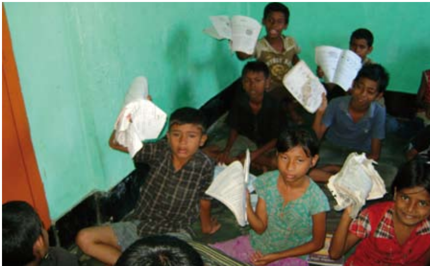
Students showing torn books.