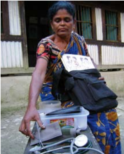
Midwife (rural area) working for an NGO, educating children about health and hygiene, and assisting pregnant women with check-ups and delivery.

ly, neither of these overcrowded hospitals are being expanded, whereas those which are being used progressively less are undergoing expansion. There is a continuing trend for people to self-refer to private Diagnostic Centres. This was very apparent in the Central peri-urban location where many showed us their test results (X-rays, USGs, test certificates – always in English). They feel confident that they are paying for modern technology and are pleased to be able to have tangible proof of the services they have paid for, which they can keep and show to others for confirmation of diagnosis and follow up treatment locally. A neighbour of our host family, diagnosed with gallstones, was typical. He self-referred to a Diagnostic Centre near the District Hospital on the advice of a neighbour and he was pleased with the result, ‘Because the centre takes a lot of money, they are more serious than the Government. It is much better than free services’ .