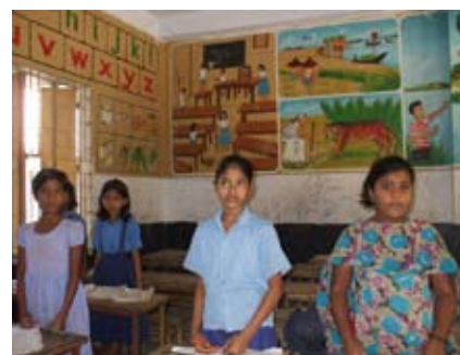
Walls are covered in illustrations at Government Primary School to inspire students and teachers.

Nearly all the Government primary schools in our study areas had initiated SLIP programmes (except the urban North), as compared to last year where tentative initiatives were only found in the one location in the Central area. The confusion about SLIP that were observed in 2007 seems now to be resolved. Where SLIP has recently been introduced, teachers were generally able to explain its purpose. Suggestions for and actual use of the grant money included; replacing fans and water pump which had been stolen (urban South), repair the latrine, repair the roof, purchase of games (Central rural). A rural school (Central) has received its SLIP money (Tk20,000) and have posted a list of things done with the first tranche in the teachers’ room. Last year they told us of a number of problems with the school including a leaking roof, lack of electricity and fans, and dangerous steps up to the verandah but none of these were