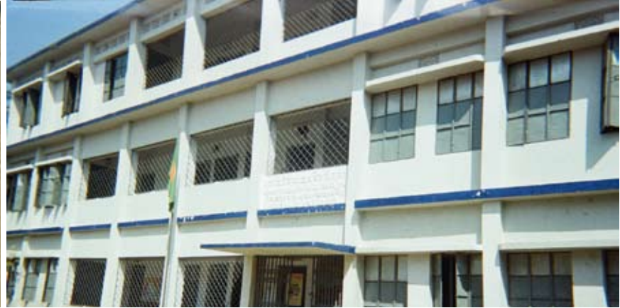
Government Primary School.

single-storied extension in the Central peri-urban area; 'We like it because it is nice and clean' (students). In the peri-urban South area, a new Cyclone shelter-cum-school has been built, but the building has not been officially handed over and the plan to commence use in January 2009 seems unlikely. The contractors have left but the windows have not been installed. Despite the concern that the building is not needs-based, teachers are pleased that the extra space will enable them to run one shift instead of two. A new two-roomed resource centre in the peri-urban North area remains uncompleted, due to a court injunction resulting from a land dispute.