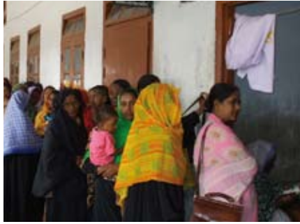
Women and children queuing outside a doctor's chambers at the district hospital.