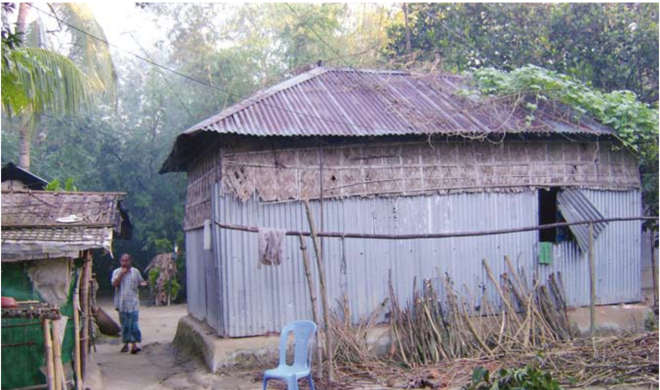
Rural household (Central).

The family continues to struggle, facing constant financial problems and cannot find food for the family every day. The husband, who has left, does not support the family leaving the wife and children with neighbours and well-wishers to care for them.