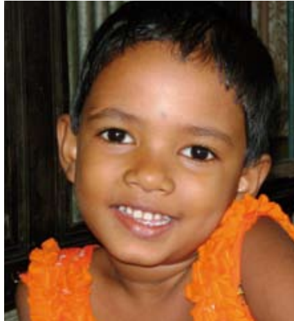
This little girl goes to pre-school. Everyone points out that she is a very good student, as is her sister.