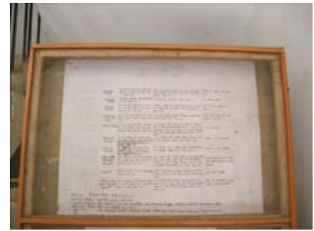
Display of Citizen's Charter in Government Primary School.

Drop out is sometimes attributed to children who have been beaten at school who refuse to return (girl in urban slum North), and in the urban Central, there was evidence of sexual harassment by a male teacher which resulted in a few girls dropping out of school. But often the claim