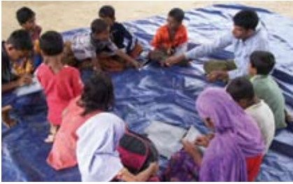
Newly established non-formal school for working children in a open place under the bridge.