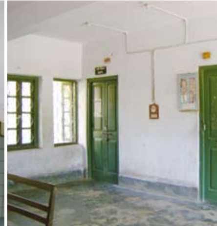
Outpatients at the Upazila Health Center closed before official closing time.

there is ‘no mismanagement now’, and this was borne out by the overflowing wards which were nearly empty last year.