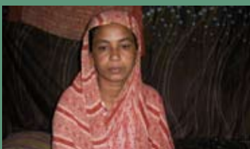
'Women from the outside have no voice in the family or in the community.' (urban, North)

family planning but his wife knew about the injectibles from her neighbours at her parents home. A polli doctor administered the injection confirming to them that it 'Was safe and not complicated' . She paid Tk100 for the first one but subsequent ones were free. However, she got pregnant even though they were careful about the dates for the injection. They don't trust the injections now and will use the pill.