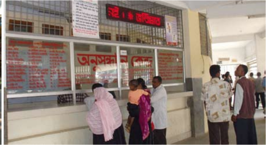
A new information centre at the district hospital.