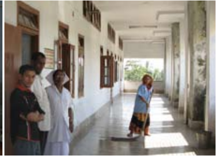
The district hospital is noticeably cleaner compared to last year (South).

speedy and good treatment as summed up by the polli doctor in the rural Central, explaining this behaviour, 'Government is government... at a private clinic they know there will be doctors at all times and that they will be caring' .