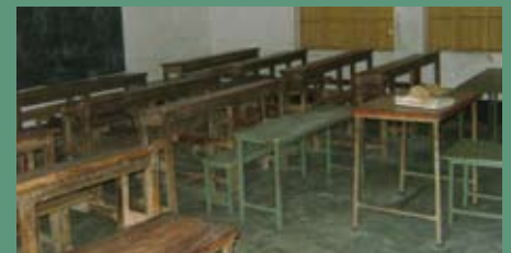
The school is empty after tiffin time (snack break) - children don't return to school.

'It is noisy', 'Overcrowded', 'Often closed', 'Teachers are often not there' and 'Teachers don't care if you are there or not' . (BRAC students views of the GPS, peri-urban Central)