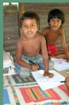
This little boy is five years old. He has never held a pen or tried to draw a picture before. He was beaming with joy when we invited him to join in the other children during a drawing session – describing qualities of a good teacher.