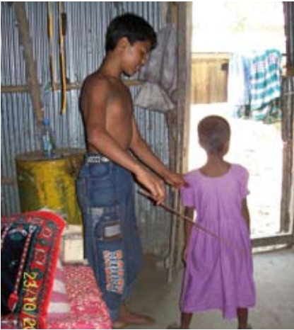
Children demonstrate the punishment they get at school.

An urban slum boy (South) shared his ambition to be a teacher; 'As a teacher I would be regular in attending class, well-behaved and not use slang language' . Others said it is important that, 'The teacher shows she loves us and that we are allowed to play and that she pays attentions to the students while teaching... and she is lively, humorous, and she smiles. And the teacher should love all equally! The teacher should come every day and help us to learn practically, showing us.... And we like if they come and check on us if we don't come to school. Also it is good if the teacher goes to our parents and asks them push us to work on other things at home' (children Class 1-4 South slum)