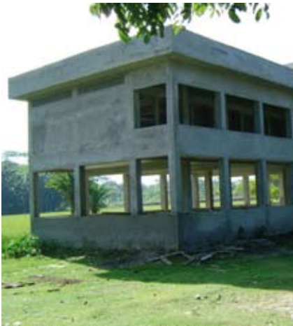
Soon to be extension of Government Primary School, a new construction under PEDP II.