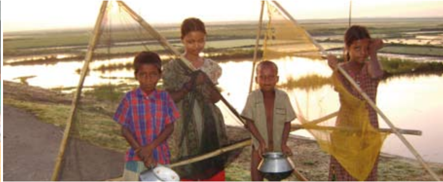
Children fishing to supplement their families' meals (North area).

home-based or private family-run schools and are particularly good at supporting slow learners and children with disabilities. Under PEDP II, school facilities have been extended and improved, school level implementation plans (SLIP) implemented and resource materials provided. Despite some concerns about the lack of local consultation and delays in construction, these initiatives have been appreciated. The focus on local decision making and local implementation of SLIP is particularly appreciated.