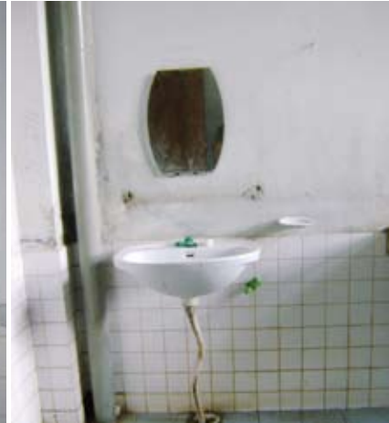
2008: still in the same condition as it was the year before.