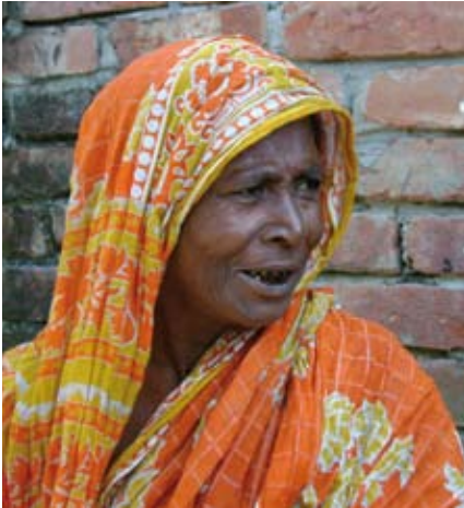
Woman living in urban slum.