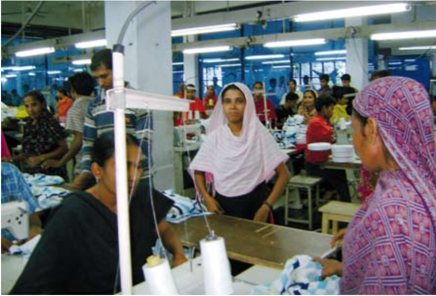
Mothers work long hours in garment factories...but get to make the financial decisions in the family.