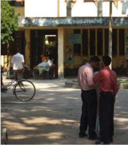
An Upazial Hospital frequented by the rural villagers.