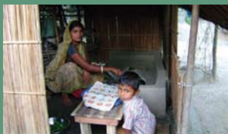
Mother helping her child with his homework while cooking.