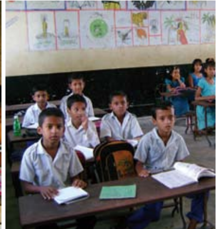
In this school there is discipline and orderliness and lots of resource materials being used.

than those in Government schools. Box 38 presents notes from a debate between mothers on the merits of BRAC versus government primary schools (peri-urban Central).