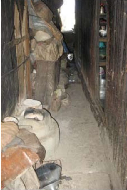
This narrow passage, which also serves as storage and kitchen, leads to a row of small one-room homes that many slum dwellers live in. (South slum).