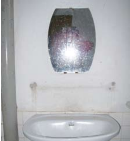
2007 – sink without plumbing in the outpatients department at the Upazila Health complex...