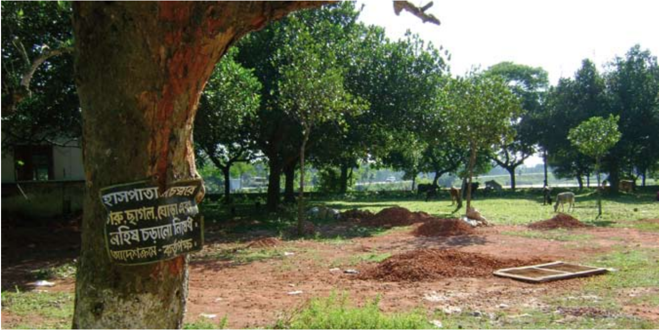
The notice on the tree outside the hospital says “Grazing of Animals is Prohibited”, but animals roam freely on the hospital grounds.