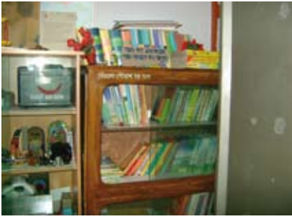
Resource materials ready to use in the better Government school. (School C – see box 36)

father, whose promising daughter failed her exams this year said: 'Is there anyone who can say that there is quality education in the Government school? Why did my daughter not understand the lessons in school? Why must she have private tutoring to make her understand? How can a poor person like me afford to continue education of children spending so much money on private coaching?' (Father of girl in Class 2, slum North)