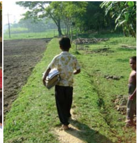
Children have to carry a large stack of school books to and from school.

children in the urban and peri-urban areas. A new ROSC school has been set up in the Central urban slum and an NGO-run school for working children operates on the outskirts of the slum. The ROSC school caters for 35 ‘out-of-school’ children, but some have transferred from formal primary schools to this one. In the South slum, there are now seven different NGO schools (two new this year) within a 1km radius of each other. These are all intended for working children and several include vocational training in the curriculum (eg. sewing, welding, mobile phone servicing, TV/radio and motorcycle repairs). These schools also have enrolled children from Government schools, either as supplementary schooling (alternative to coaching and, according to parents ‘keeps them out of trouble’) or substituting completely for the Government school. A single NGO runs three new schools for working children in the North slum, supported by Unicef, and the children attending these are genuine working children who are helpers in the market, work in shops, hotels and as domestic helpers. The teachers are very young and get 21 days basic training and four further short courses (4-5 days). One other NGO runs a pilot programme (also supported by