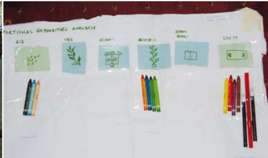
A family analysed its weekly expenditure by distributing pencils between different items of expenditure. From left to right: rice, vegetables, school, bamboo, school books and NGO loan. Before doing this exercise, the father tried to hide the fact that the headmaster of the private school let his boys attend for free and that he had a very large NGO loan.

considerable private sector investment in garment factories, transport, overseas labour and servicing the Dhaka construction industry with high female employment. The implications of these contextual differences on the experiences of and perspectives on health and education service provision are important in understanding the findings which are presented in the two following sections.