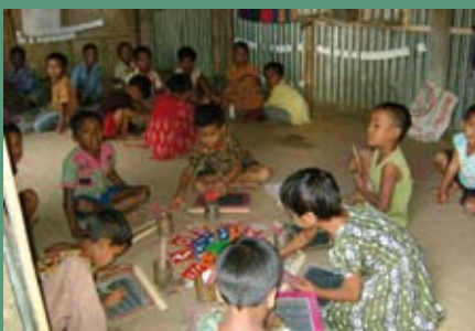
Typical BRAC preschool.

feeder schools) do better as they have children who should be in class 9 studying with them and teachers only have to focus on one class and no extra tasks. But we always have to think about our next class'. Teachers from School A said it is, 'Easier for BRAC teachers because they have 3 hours with the same children' .