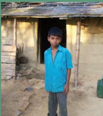
"My dreams are lost because I cannot get better" (Boy, 13 years old)

As we reported last year, Government hospitals are regarded as expensive as so much has to be bought from outside. A peri-urban woman (South) told us, 'I cannot feed my (sick) husband, so how can I buy him medicine? The doctor was always writing a slip about what medicine to take and we have to buy it from outside, but when we go there we cannot manage to pay for it. If