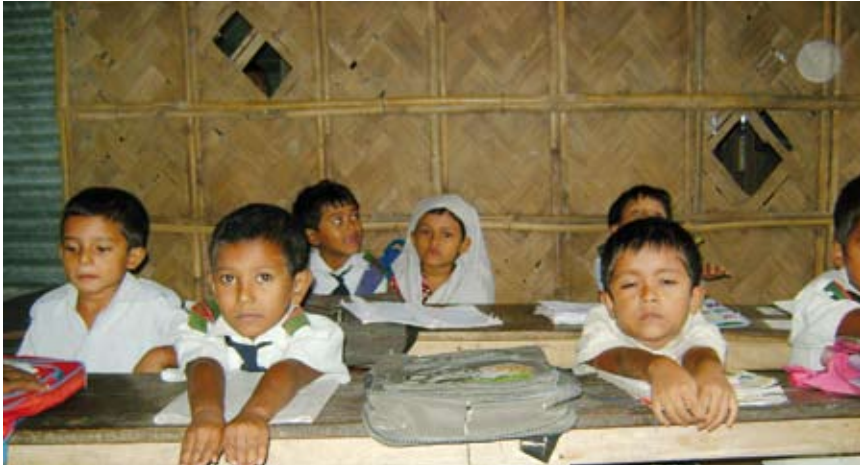
The first pre school class (for 3–4 year olds) is called 'Playschool' in this private school, but it doesn't involve much play.