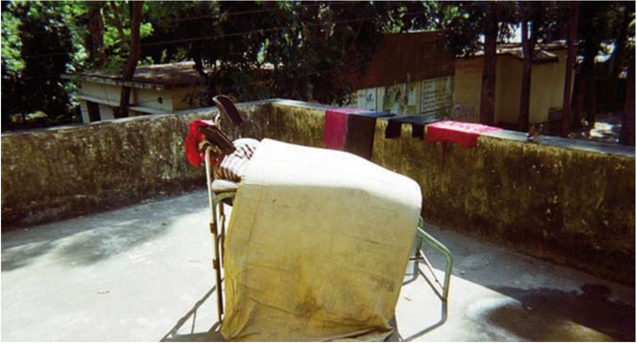
The village women complain that there is no emergency service available during pregnancy and delivery at their nearest Upazila Health Complex. When visiting the hospital, we found that the gynecological examination chair had found new use as a laundry rack.

that their roles overlapped, that nutrition programmes were largely unnecessary and that community clinics should be re-established but were frustrated that these issues could not be discussed. The UHFPO in the peri-urban UHC in the South has recently taken up this post and has extensive experience. He shared many innovative ideas he wished to introduce, including one he had experienced working in another UHC where minor surgery capacity was enhanced (under an EU programme), but with elections looming and political interference he feels it will be years before decisions can be made. He says it is particularly difficult because the Upazila Nirbahi Officer, who has ultimate power over decisions, does not understand how health facilities should be managed. He feels frustrated that he has to accept the decisions of 'bureaucratic careerists' .