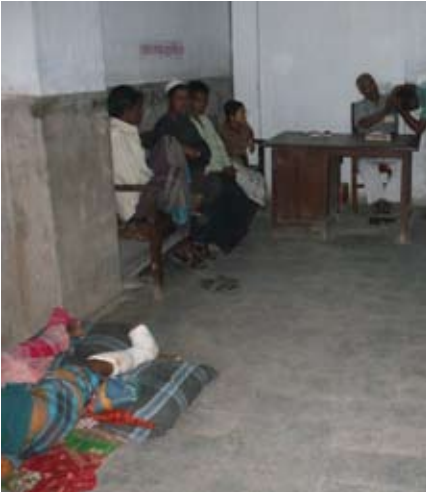
Emergency waiting room at Government Hospital.