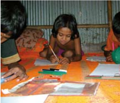
Children drawing what they like and dislike about school.