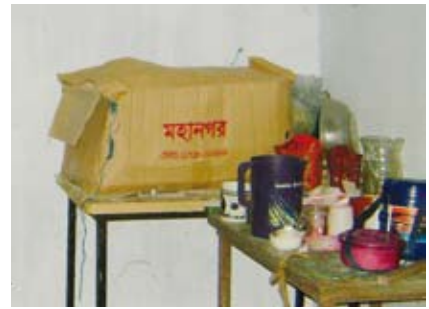
The box of school resource school materials remains unpacked in the teacher's room. (School A – see box 36)

But, generally the Government schools are regarded as offering inferior quality and there are many reasons put forward for this. We often heard the comment that because teachers are on the Government payroll, their tenure is secure and they therefore 'don't bother' or 'are not motivated' . One