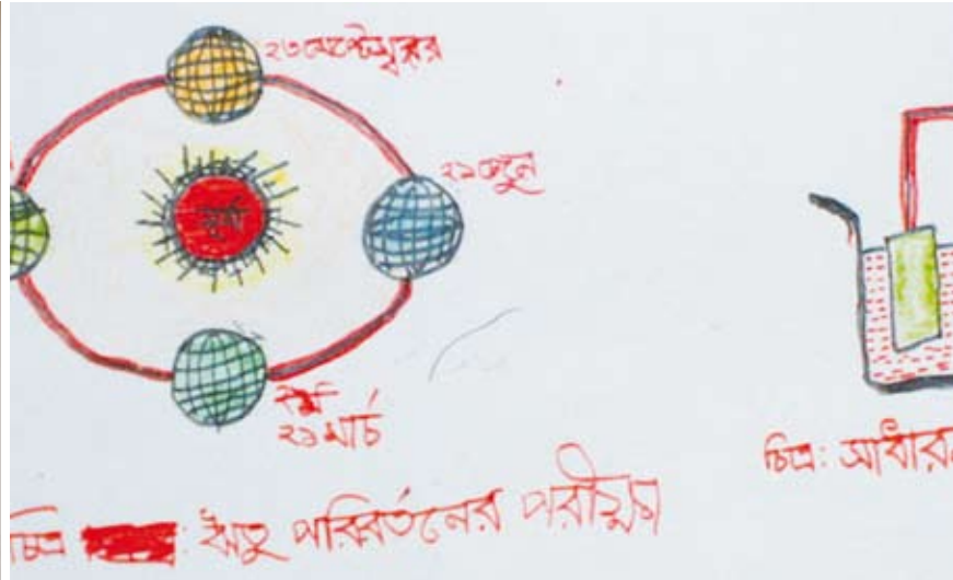
Sattar (age 10) likes science, especially when teachers use pictures, such as this drawing by Sattar himself, to illustrate what they are teaching.

he would be distracted by other boys and get into trouble. The busy and dangerous main roads are a problem for some and constrain choice (in all areas). A mother in the peri-urban North sends her children to the nearby madrasa, because the other schools are too far away.