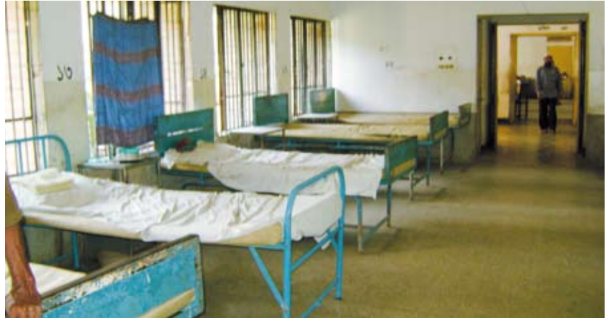
Despite overcrowding in District Hospitals there are empty beds.