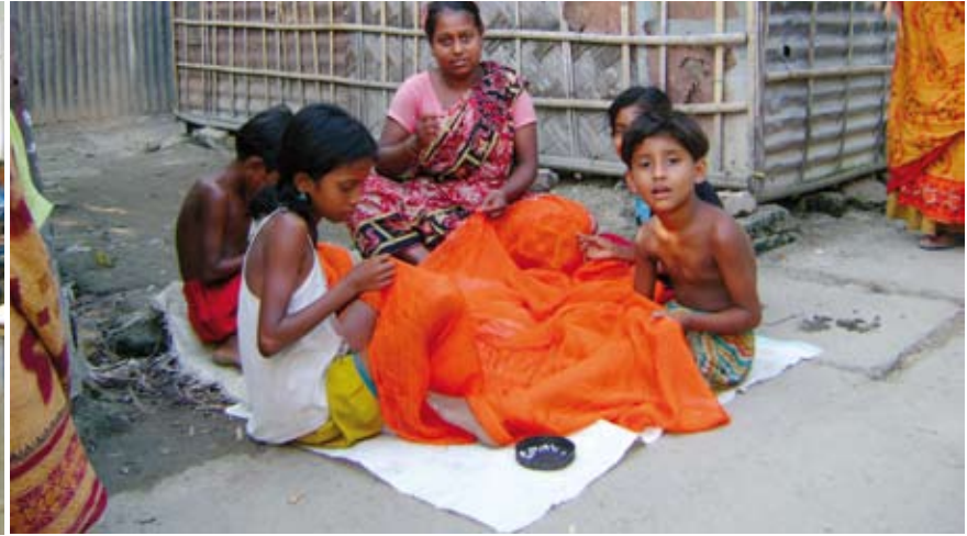
Children doing piece work to contribute to their school costs.

reprimanded and is now following the 40% rule. A young teacher said it would be, 'Better to give to all or not at all' (rural Central).