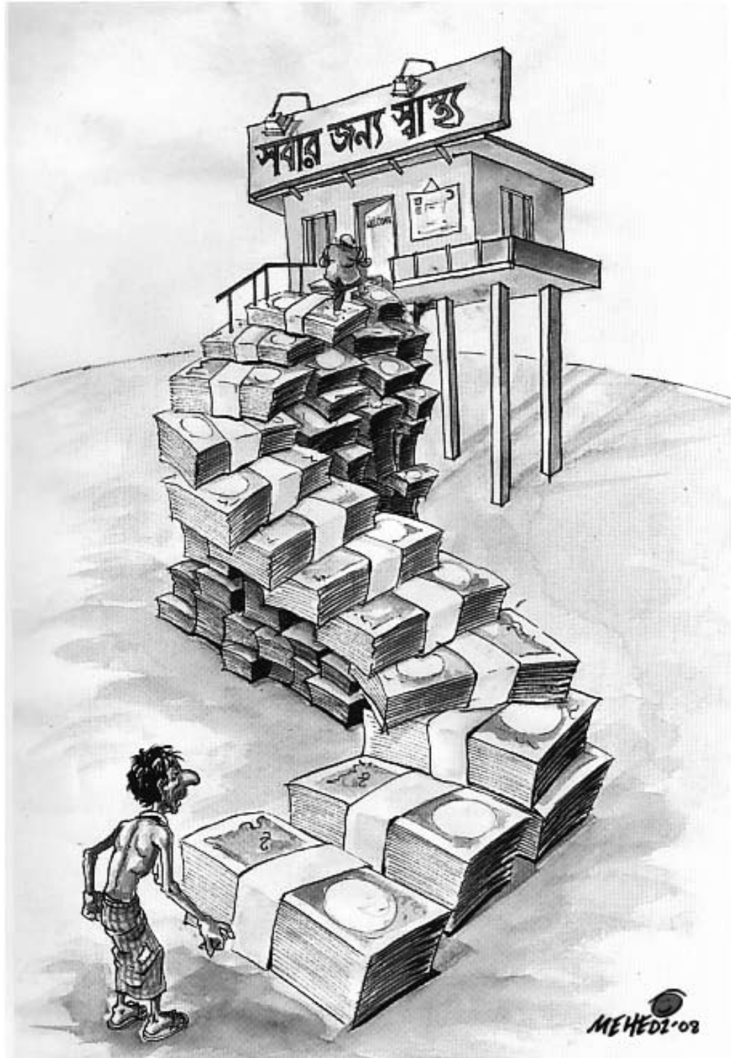
Accessing health services can be seen by people living in poverty as very costly.