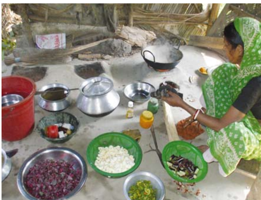
The wife of our Host Household preparing a rich meal for extended family. (rural, South).

There are no changes at all in this family. Both older daughters are still in school, with the elder one promoted to Class 2 but second one did not get promoted. Their cow delivered a calf a few months ago and they are getting ½ litre milk per day which is feeding their younger baby. During the rainy season they took a Tk2000 loan from a relative and bought a fishing boat for Tk2500 but within few days the boat was stolen. They still have to repay their loan.