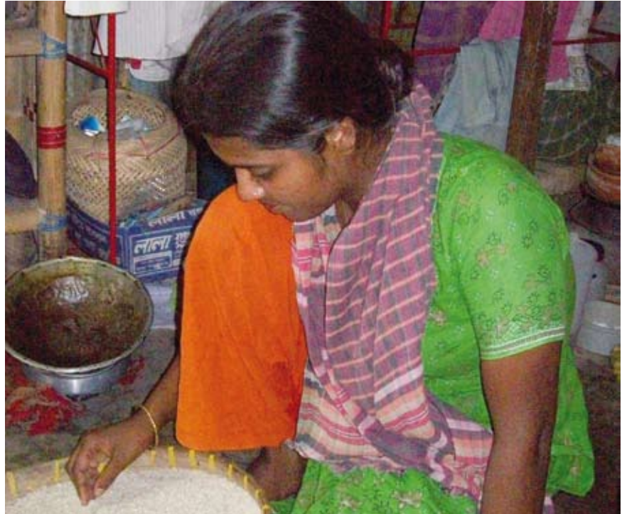
This girl has TB... again. She is very depressed that even having completed treatment she is again suffering from TB.

us that 15 days worth of tablets are given at one time and there is no direct observation.