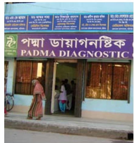
One of the many private diagnostic centres.

There is no change in how people perceive quality of health service provision from last year. The criteria include speed of cure, being given respect and attention, time and clear explanations, being able to see the same medical service provider on subsequent visits and not being asked to make many repeat visits for check up and diagnostic tests, (which cost time and money) except perhaps a stronger rationalisation of using private services because paying 'guarantees good service' . Above we quoted the polli doctor in the rural Central area who said that, 'At a private clinic there will be doctors and they will be caring' , and the man who had self-referred to a private Diagnostic Centre because, 'It takes a lot of money and they are more serious than the Government hospital. It is much better than a free service' (peri-urban Central). Such comments are typical of many people who explain why they chose private rather than state health services. The fact