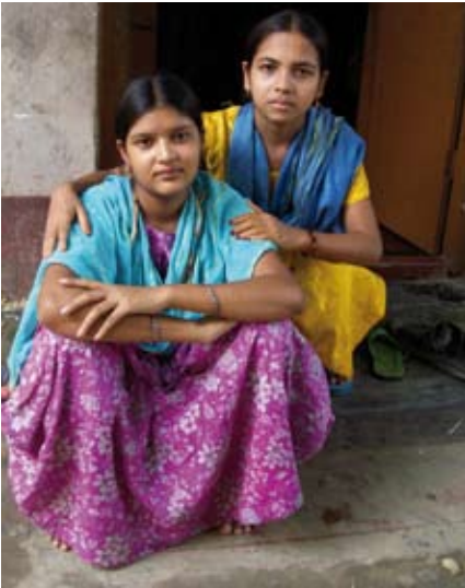
This young girl is pregnant and intends to have a USG to check the position of her baby but has not bothered to have any other check ups during her pregnancy.

They charge a flat rate of Tk800 for a normal delivery and Tk1500 for stitches. As a result of their activities, they say that ‘at risk’ mothers are better identified, but experience shared by families using their services suggests that they intervene unnecessarily and beyond their competence because of the profit motive. This leads to delayed referral and increased risk. The profit incentive has also meant that they now operate beyond their designated service areas (this has been made possible because of their use of mobile phones). The sisters regularly provide injections (oxytocin) to increase labour contractions (at least 3/10 are said to need this) but, contrary to SBA training guidelines, no records are being made of this. The sisters are defensive about their work. ‘TBAs and village doctors are jealous of my income and are spreading bad rumours around’ , one tells us (see Box 6).