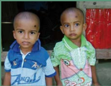
The parents of these toddlers are already making plans for their sons' education.

Rather than being essential, most parents regard the stipend as an important additional contribution to educational costs, and most use it to fund private coaching (see Box 22). Several parents, and particularly teachers, said the stipend covers too few students. In a school where everyone is considered poor, it is hard for the SMC and teachers to make choices about who should receive the stipend. 'Actually the need (for stipends) is much higher, more like 80% of students. I think they should halve the amount of stipend and give it to 80%' (head GPS peri-urban South). A head in the North who was doing just this under his own initiative last year has been