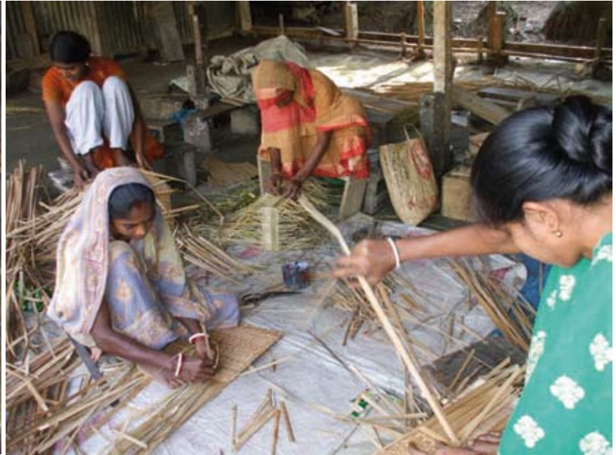
Women working for an NGO craft enterprise to supplement family income (South).

If you go to the market you will have to pay Tk200 per kg for beef, and only two years ago it was Tk90. And for selling the leather from the cow, that price has been the same for over five years! So the price of things we need to consume is going up, but for our own production, that price is going down or staying the same. The poor people living here, they eat less food now. (Urban Community leader, South)