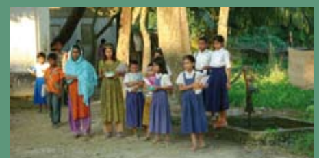
Children have to wait for school to start - they're on time, but the school is late.