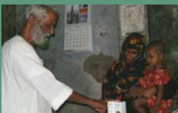
Polli doctor provides treatment and advice.