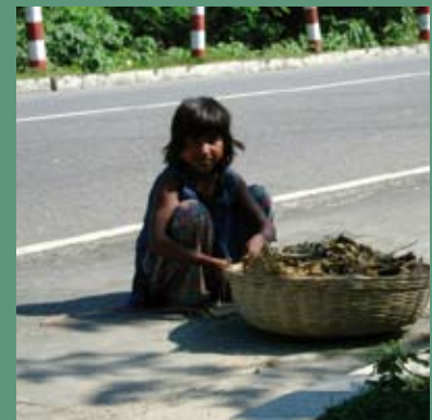
This girl lived with another family for a year working as a maid. Her parents are very poor, and needed the extra income. This year she has started school and is very happy, although she also said that working as a maid was not bad - the family treated her nicely.

In the rural South, we were told it is easy to get a job if you are uneducated as there are plenty of NGOs with handicraft centres which employ uneducated women. 'For an educated man there is nothing to do here, everyone is planning to move' a man tells us. Girls with class 10 education are trying to get work in Dhaka in garment factories but competition is fierce and, 'A class 10 pass is no guarantee to get a job in the garments' .