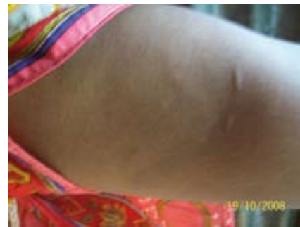
A woman shows off her Norplant implant.

The two sisters we met last year in the Central peri-urban area are still operating as SBAs, but are now more organised and have more influence than last year. They maintain a list of pregnant women in the area, provide them with mobile phone numbers to call in case of need, and make house-to-house visits, maintaining a better network for referral. The SBA's approach is becoming much more commercialised and profit oriented. Even last year people said of them 'Now they have a big bag and training, they expect more money' and 'They run after money' (2007 Report p 26).