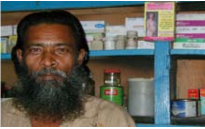
Polli doctor sells contraceptives to all, including unmarrieds, and has a pregnancy testing kit for sale.

necessary but instead was forced on the mother by her mother-in-law. She chatted at length about the deliveries she has observed in hospital, but feels the process is embarrassing. She criticised the position that they adopt to give birth, saying 'Women cannot push on their backs, squatting is much better' . She confirmed that she will give 'saline' if the labour is long and requests the elderly polli doctor from the market to administer this. He told us he used to work as a male dai before (he has over 70 years of experience). He administers pertoxin (also known as oxytocin) and salts separately to help give energy and increase contractions.