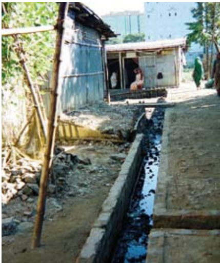
Construction of good drains has improved the disposal of wastewater (North).