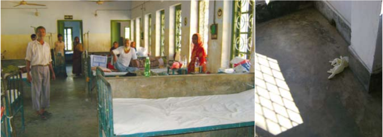
Hospital wards are cleaner and neater than in 2007.