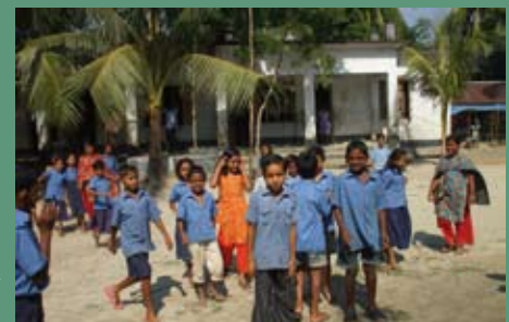
Play-time at the Government Primary School.