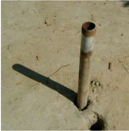
A deep tubewell has been sunk on the grounds of the Government Primary School, but it is faulty and has been abandoned by the construction company.