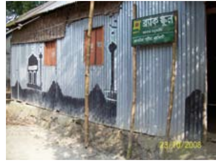
A new BRAC school.

The third change is a slight increase in the use of madrasa. Parents will send very young children to the madrasa to ensure 'they are more pious' (North slum) although in the North, the high cost of this particular madrasa (Tk450 admission and Tk100 per month) has led to the decision by our families to withdraw. Another madrasa in the North (peri-urban)