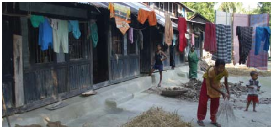
Rural household (South).

The Reality Check study is only possible thanks to the many families living in poverty in Bangladesh who opened their doors to the study team. We thank these families in all nine locations for contributing their valuable time and allowing the team members to live with them and share their day to day experiences.