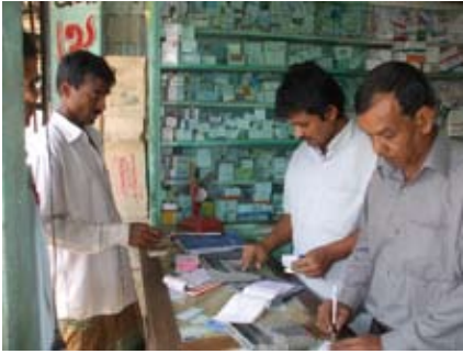
One of the many well stocked pharmacies open long hours.