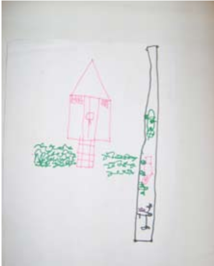
"I don't like the long walk to school and I'm afraid of the road – a boy was killed there last year".